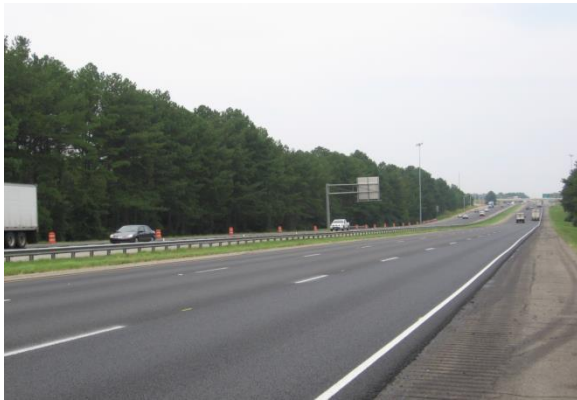
I-75 at Perryville, GA

I-75 is a major artery in GA, connecting Atlanta to southern Georgia and Florida. The roadway is located in a subtropical climate where stripping and rutting are significant issues for asphalt road construction. The region is exposed to extended periods of higher temperatures, humidity and rainfall.